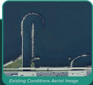
Existing Conditions Aerial Image